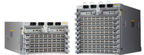
Figure 1: Arista 7500E series modular data center switches

efficient with typical power consumption of under 4 watts per port for a fully loaded chassis. All these attributes make the Arista 7500E an ideal platform for building reliable, low latency, resilient, and highly scalable data center networks.