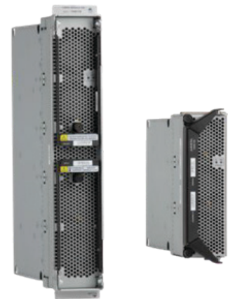
Figure 12: Arista 7500 Series fabric modules

hash-based selection of fabric links, the 7500E architecture provides 100% efficient connectivity from any port to any other port with no drops. The fabric modules are always active-active, provide N+1 redundancy, and can be hot-swapped with zero performance degradation. The fabric modules for the 7508E and the 7504E are different, based on the size of the chassis, and both integrate a fan assembly for flexible and redundant cooling.