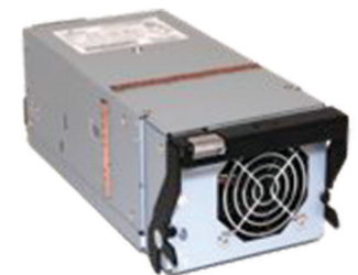
Figure 13: Arista 7500 Series power supply

The 7500E series switches are equipped with four 2900W AC power supplies. The power supplies are 2+2 grid redundant and hot-swappable. The power supplies are gold climate saver rated and have an efficiency of over 90% with single stage conversion to the internal 12V DC voltage.