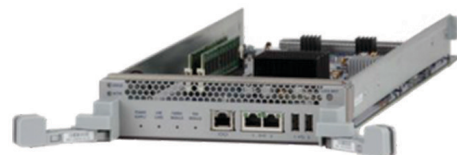
Figure 11: Arista 7500 Series supervisor

The supervisor modules for the 7500E series run Arista Extensible Operating System (EOS) and handle all control plane and management functions of the system. One supervisor module is needed to run the system and a second can be added for stateful 1+1 redundancy. Each supervisor module takes up only a half slot resulting in very efficient use of space and a higher density design. The quad-core x86 CPU with 16 GB of DRAM and an optional SSD provides the control plane performance needed to run an advanced data center switch scaling to over 1000 physical ports and thousands of virtual ports. A pulse per second clock input port enables synchronizing with an external source to improve the accuracy of monitoring tools.