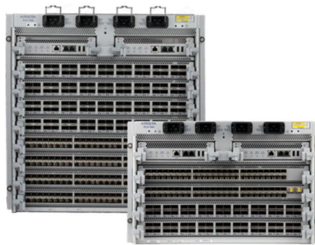
Figure 10: Arista 7500 Series Chassis

The 7500E chassis provides room for two supervisor modules, four or eight line card modules, four power supply modules, and six fabric modules. The 7504 chassis fits into 7-rack units while the 7508 chassis fits into 11U of a standard data center rack. Supervisor and line card modules plug in from the front, while the fabric and power supply modules are inserted from the rear. The midplane is completely passive and provides control plane connectivity to each of the fabric and line card modules. The system design is optimized for data center deployments with front-to-rear airflow.