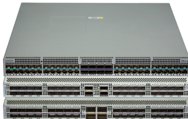
Arista 7280R3 MACsec systems

The 7280R3 MACsec systems can be deployed in a wide range of open networking solutions including secure Data Center Interconnect (DCI), large scale layer 2 and layer 3 cloud designs, overlay networks and virtualized or traditional enterprise data center networks. Deep packet buffers and large routing tables allow for internet peering applications. The broad range of interfaces and density choice provides deployment flexibility.