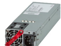
Hot swap power supplies