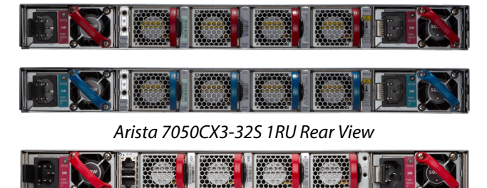
Arista 7050SX3-48YC12 1RU Rear View