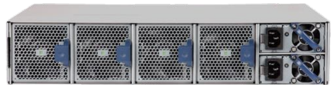
Arista 7050X 2RU Rear View: Rear-to-front airflow model (blue)