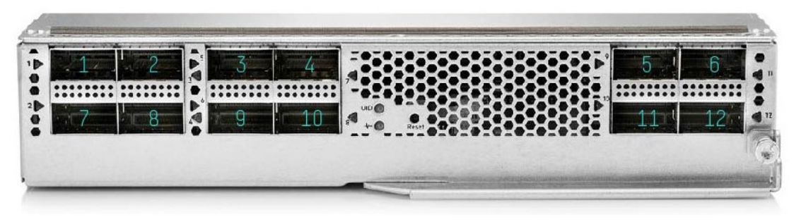
12 QSFP28 ports