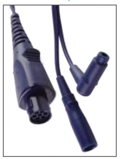
ESG-400 Compatible Cable