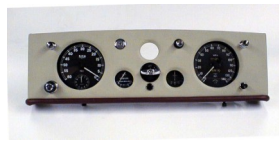
120 Roadster—Early Cent Dash