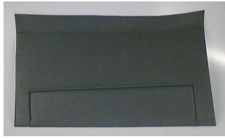
120 DHC Door Panel