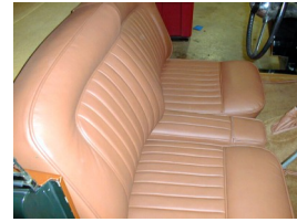
120 Coupe Interior