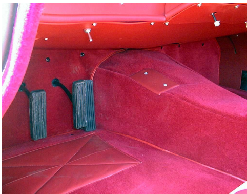
XK 120 CARPET—DRIVER'S SIDE