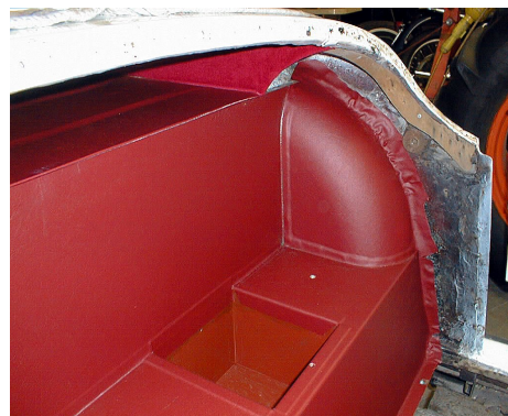
XK 120 BATTERY AREA