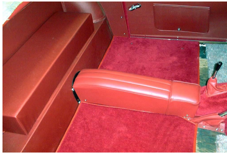
XK 120 CARPET—REAR