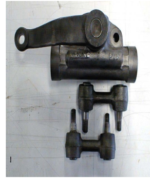
120 Roadster Rear Shock & Link