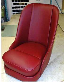
120 Vintage Racer—Race Seat