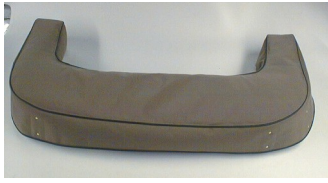
120 DHC Boot Cover