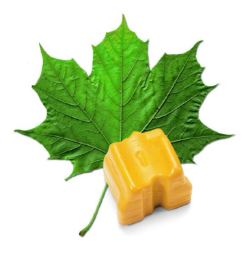
Solid ink is earth-friendly. It generates 1/40th the waste of a typical color laser device.