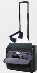
ThinkPad Radiant Roller - PN 78Y2375