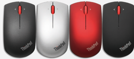
ThinkPad Precision Wireless Mouse - Midnight Black 0B47163, Heatwave Red 0B47165, Frost Silver 0B47167, Graphite Black 0B47168, Midnight Black 0B47153