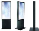
Totems TOT-XXWE6-IR10 TOT-XXWE6-CA10