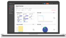
TEOS Manage licenses TEM-CO10 TEM-MR10 TEM-DS10