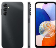
Samsung Galaxy A14 5G 4/128GB

SSG-PSMA146PZKGTHL (Black) SSG-PSMA146PZSGTHL (Silver)