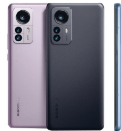
Xiaomi 12 Pro (12GB/256GB)

XMI-6941812713983 (Midnight Black) XMI-6941812714188 (Polar White)