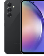
Samsung Galaxy A54 5G 8/256GB

SSG-PSMA546EZKDTHL (Black) SSG-PSMA546ELGDTHL (Light Green) SSG-PSMA546ELVDTHL (Light Violet)