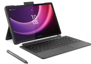
TAB P11 2nd gen TB-350XU (4G Data)