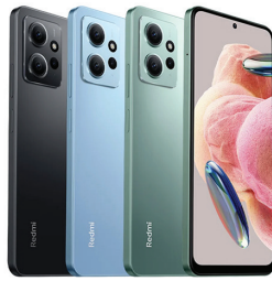
Redmi Note 12 (8GB/256GB)

XMI-6941812739945 (Ice Blue) XMI-6941812739921 (Ice Blue) XMI-6941812740033 (Onyx Gray) XMI-6941812740019 (Onyx Gray) XMI-6941812740026 (Mint Green) XMI-6941812740040 (Mint Green) XMI-6941812744888 (Sunrise Gold) XMI-6941812744703 (Sunrise Gold)