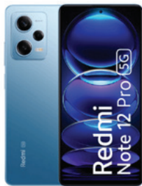
Redmi Note 12 Pro 5G (8GB/256GB)

XMI-6941812709801 (Polar White) XMI-6941812710265 (Sky Blue) XMI-6941812710296 (Midnight Black)