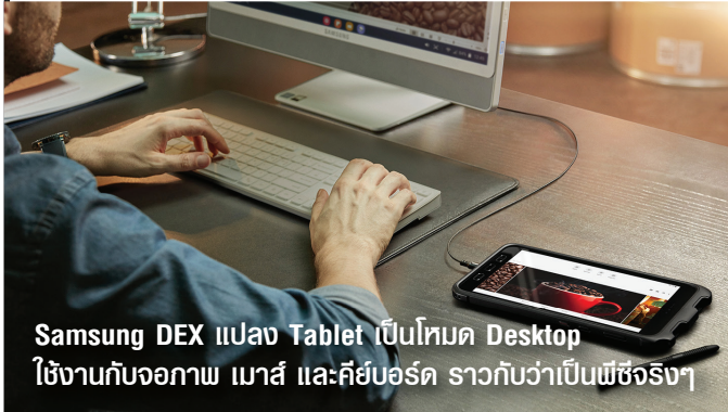
Samsung DEX แปลง Tablet เป็นโหมด Desktop ใช้งานกับจอภาพ เมาส์ และคีย์บอร์ด ราวกับว่าเป็นพีซีจริงๆ

Galaxy Tab Active 3 แท็บเล็ตสุดอึด!! กันน้ำกันฝุ่น กันกระแทกได้ถึง 1.5 เมตร มีโหมด No Battery สลับไปใช้งานจากแหล่งจ่ายไฟตรง โดยไม่ผ่านแบตเตอรี่ของตัวเครื่อง