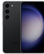
Samsung Galaxy A05s 6/128GB

SSG-PSMA057FZSHTHL (Silver) SSG-PSMA057FZKHHTHL (Black)