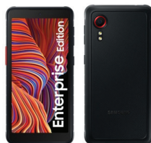
Samsung Galaxy xCover 5 EE