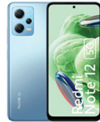
Redmi Note 12 5G (8GB/256GB)

XMI-6941812706886 (Ice Blue) XMI-6941812706817 (Forest Green) XMI-6941812707203 (Onyx Gray) XMI-6941812706893 (Ice Blue) XMI-6941812707210 (Forest Green) XMI-6941812706848 (Onyx Gray)