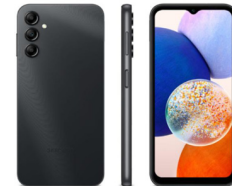
Samsung Galaxy A14 4/128GB

SSG-PSMA057FZSHTHL (Silver) SSG-PSMA057FZKHHTHL (Black)