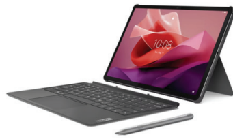
TAB P12 TB-370FU (Wifi)