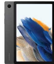
Samsung Galaxy Tab A8 (Wi-Fi) 4/64GB

SSG-PSMT225NZAATHL (Gray) SSG-PSMT225NZSATHL (Silver)