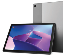
TAB M10 TB-328XU