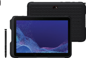
Samsung Galaxy Tab Active 4 Pro EE 5G