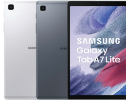
Samsung Tab A7 Lite (LTE)

SSG-PSMT735NLGATHL (Green) SSG-PSMT735NLIATHL (Pink) SSG-PSMT735NZSATHL (Silver) SSG-PSMT735NZKATHL (Black)