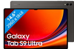
Samsung Galaxy Tab S9 Ultra 5G 12/256GB