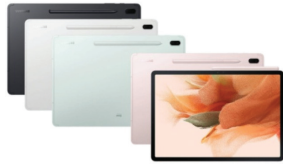
Samsung Tab S7 FE (LTE)

SSG-PSMT735NLGATHL (Green) SSG-PSMT735NLIATHL (Pink) SSG-PSMT735NZSATHL (Silver) SSG-PSMT735NZKATHL (Black)