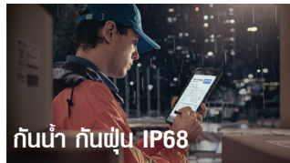
กันน้ำ กันฝุ่น IP68