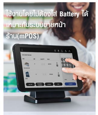
ใช้งานได้โดยไม่ต้องใส่ Battery ได้ เหมาะกับระบบขายหน้าร้าน (mPOS)