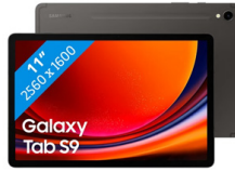
Samsung Galaxy Tab S9 WIFI 8/128GB

SSG-PSMX710NZAATHL (Graphite) SSG-PSMX710NZEATHL (Beige)