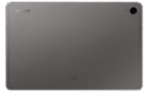
Samsung Galaxy Tab S9 FE 6/128GB 5G

SSG-PSMX516BZAATHL (Gray) SSG-PSMX516BLGATHL (Mint) SSG-PSMX516BLIATHL (Lavender)