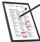
TAB P11 Pro TB-132FU (Wifi)