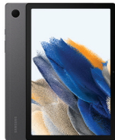
Samsung Galaxy Tab A8 (LTE) 4/64GB

SSG-PSM205NZAETHL (Gray) SSG-PSMX205NIDETHL (Pink Gold)