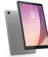
TAB M8 TB-300XU (4G ในเน็ต )