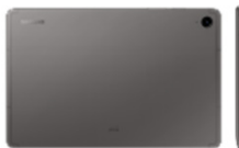
Samsung Galaxy Tab S9 FE 6/128GB Wi-Fi

SSG-PSMX510NZAATHL (Gray) SSG-PSMX510NLGATHL (Mint) SSG-PSMX510NLIATHL (Lavender)