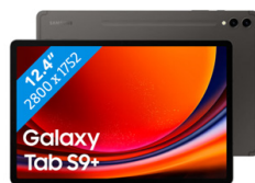
Samsung Galaxy Tab S9+ WIFI 12/256GB