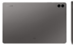
Samsung Galaxy Tab S9 FE+ 8/128GB 5G

SSG-PSMX616BZAATHL (Gray) SSG-PSMX616BLGATHL (Mint)