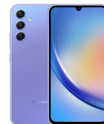
Samsung Galaxy A34 5G 8/256GB

SSG-PSMA245FZKVTHL (Black) SSG-PSMA245FZSVTHL (Silver)