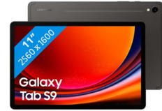
Samsung Galaxy Tab S9 5G 8/128GB

SSG-PSMX716BZAATHL (Graphite) SSG-PSMX716BZEATHL (Beige)