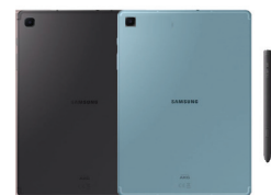
Samsung Galaxy Tab S6 Lite/64GB LTE

SSG-PSMP613NZAATHL (Gray) SSG-PSMP613NZBATHL (Blue) SSG-PSMP613NZIATHL (Pink)