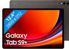
Samsung Galaxy Tab S9+ 5G 12/256GB