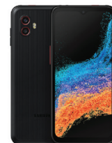
Samsung Galaxy Xcover 6Pro EE 5G