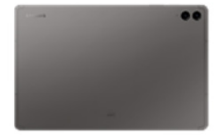
Samsung Galaxy Tab S9 FE+ 8/128GB Wi-Fi

SSG-PSMX610NZAATHL (Gray) SSG-PSMX610NLGATHL (Mint)