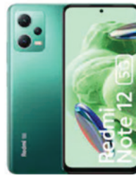
Redmi Note 12 5G (6GB/128GB)

XMI-6941812739945 (Ice Blue) XMI-6941812739921 (Ice Blue) XMI-6941812740033 (Onyx Gray) XMI-6941812740019 (Onyx Gray) XMI-6941812740026 (Mint Green) XMI-6941812740040 (Mint Green) XMI-6941812744888 (Sunrise Gold) XMI-6941812744703 (Sunrise Gold)