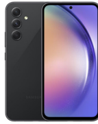
Samsung Galaxy A54 5G 8/128GB

SSG-PSMA546EZKCTHL (Black) SSG-PSMA546ELGCTHL (Light Green) SSG-PSMA546ELVCTHL (Light Violet)