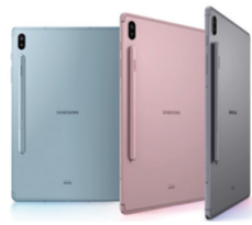
Samsung Galaxy Tab S6 Lite/64GB WIFI

SSG-PSM205NZAETHL (Gray) SSG-PSMX205NIDETHL (Pink Gold)