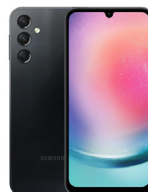
Samsung Galaxy A24 LTE 6/128GB

SSG-PSMA245FZKVTHL (Black) SSG-PSMA245FZSVTHL (Silver)