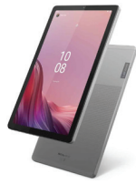
TAB M9 TB-310XU (4G ไร้สาย)