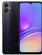
Samsung Galaxy A05 4/128GB

SSG-PSMA055FZSGTHL (Silver) SSG-PSMA055FZKGTHL (Black)