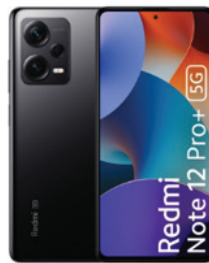
Redmi Note 12 Pro+ 5G (8GB/256GB)

XMI-6941812709801 (Polar White) XMI-6941812710265 (Sky Blue) XMI-6941812710296 (Midnight Black)