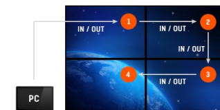
Daisy Chain Support

Thanks to Android OS, you can easily customize the display to your needs by installing applications directly to it.