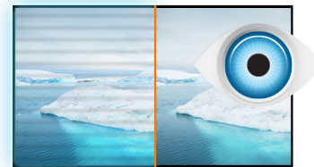
Flicker-free + Blue light

AMVA+ Panel technology offers 24 bit ‘True Colour’ performance and amazing viewing angles.