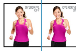
OverDrive ON / OFF

Controlling the monitor's brightness through electric current has allowed us to eliminate the screen flicker. You can easily test it yourself – just look at the screen via you smartphone's camera. Your eyes will love it.