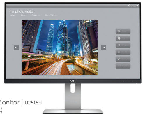
Dell UltraSharp 25 Monitor | U2515H 63.44 cm (25 inches)

For More Information visit www.dell.com/monitors