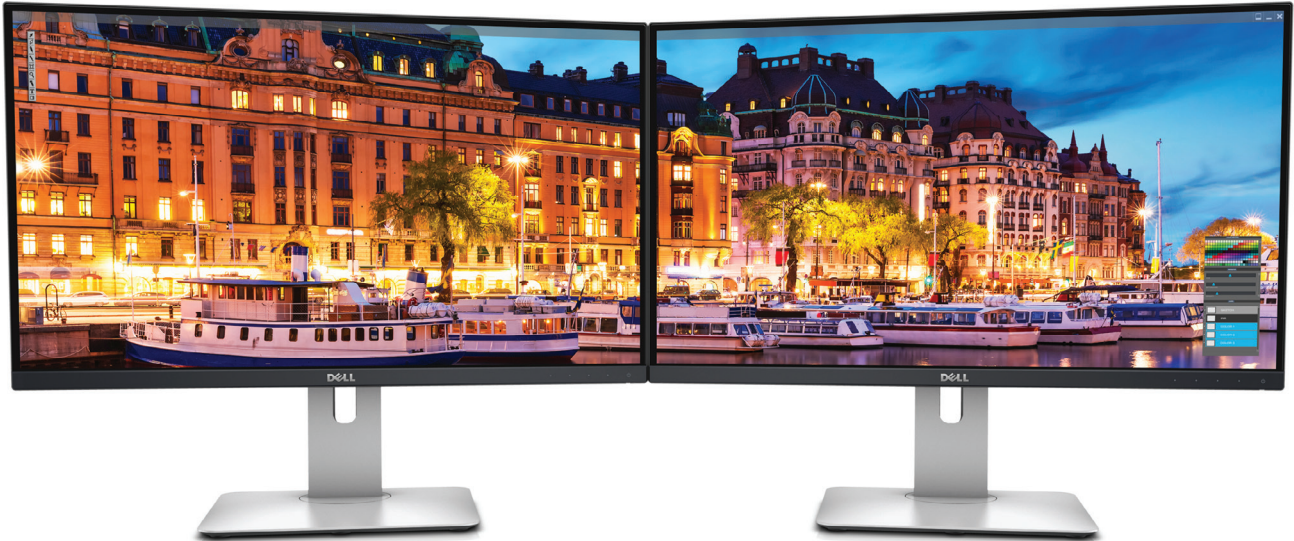
Dell UltraSharp 25 Monitor | U2515H 63.44 cm (25 inches)