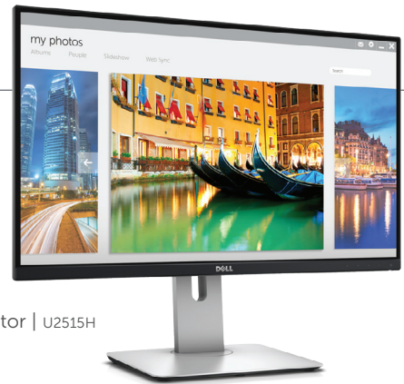
Dell UltraSharp 25 Monitor | U2515H 63.44 cm (25 inches)