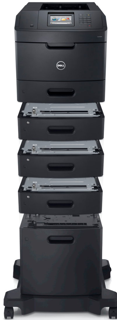
— 100-Sheet Multi-purpose Tray