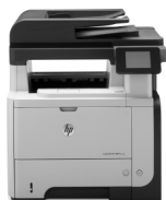
HP LaserJet Pro MFP M521dn