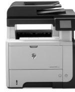
HP LaserJet Pro MFP M521dw