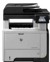
HP LaserJet Pro MFP M521dn