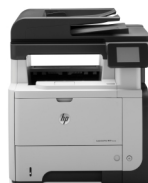
HP LaserJet Pro MFP M521dw