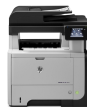
HP LaserJet Pro MFP M521dw