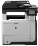
HP LaserJet Pro MFP M521dn