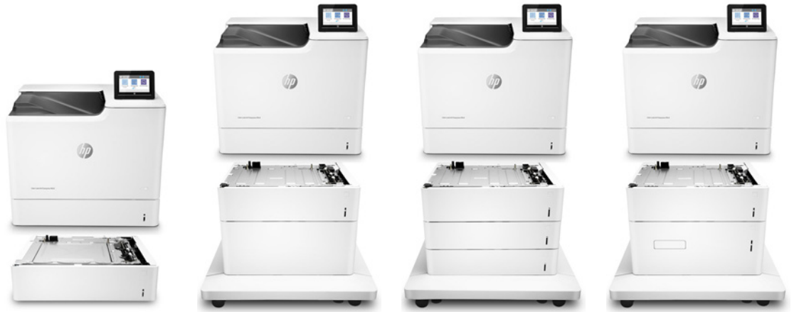
550-sheet Paper Feeder (P1B09A)