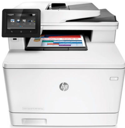
Make the most of your work space with a compact MFP that's the smallest in its class 1

Accomplish tasks faster and keep your device, data, and documents protected—from boot up to shut down. Scan documents easily and efficiently. Print your first page and produce two-sided prints faster than the competition. 2