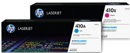
Original HP Toner cartridges with JetIntelligence

Bring out the best in your MFP. Print more professional-quality colour pages, 3 using Original HP Toner cartridges with JetIntelligence. Count on better performance, higher energy efficiency, and the authentic HP quality that the competition simply can't match. 3