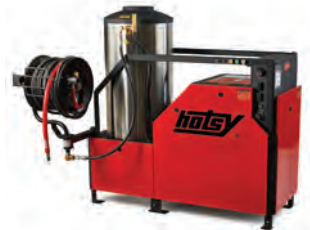
Black Label version comes with hose & hose reel

Upright, vertical coil with 1/2-inch schedule 80 pipe is wrapped with a thick ceramic fiber insulation, delivering high efficiency and maintains constant temperature using Natural Gas or LP Gas