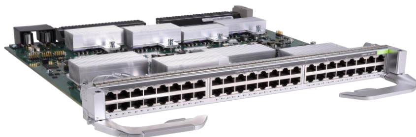
Figure 3. Cisco Catalyst 9600 48-port RJ45 Copper - 10GE/5GE/2.5GE/1GE/100Mbps/10Mbps Line Card (C9600-LC-48TX)