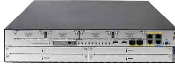
HPE MSR3044 Router (JG405A)