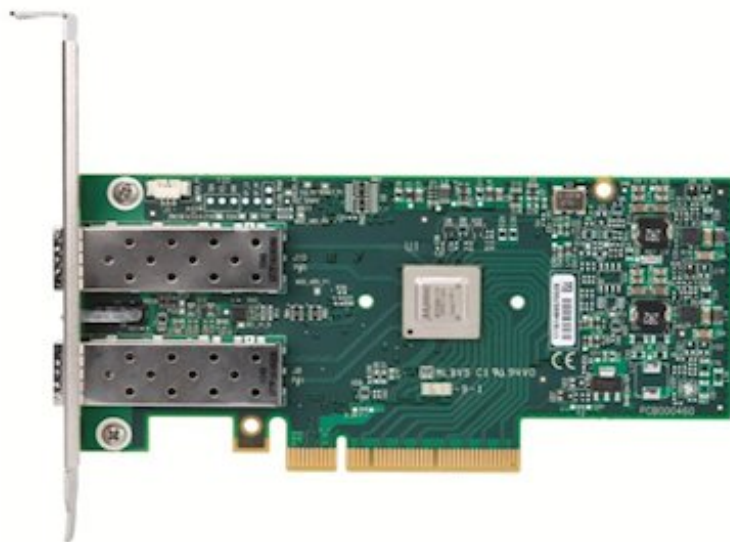
Figure 1. Mellanox Connect X-3 10GbE Adapter for System x (3U bracket shown)

Mellanox's ConnectX-3 and ConnectX-3 Pro ASIC delivers low latency, high bandwidth, and computing efficiency for performance-driven server applications. Efficient computing is achieved by offloading from the CPU routine activities, which makes more processor power available for the application. Network protocol processing and data movement impacts, such as InfiniBand RDMA and Send/Receive semantics, are completed in the adapter without CPU intervention. RDMA support extends to virtual servers when SR-IOV is enabled. Mellanox's ConnectX-3 advanced acceleration technology enables higher cluster efficiency and scalability of up to tens of thousands of nodes.