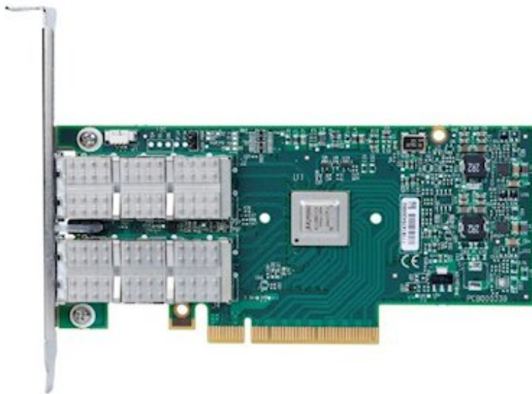
Figure 2. Mellanox ConnectX-3 40GbE / FDR IB VPI Adapter for System x with 3U bracket (attached heatsink removed)

Figure 2 shows the Mellanox ConnectX-3 40GbE / FDR IB VPI Adapter (the shipping adapter includes a heatsink over the ASIC but the figure does not show this heatsink)