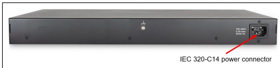
Figure 3. Rear panel of the CE0152TB switch

The following figure shows the rear (non-port-side) panel of the CE0152TB switch.