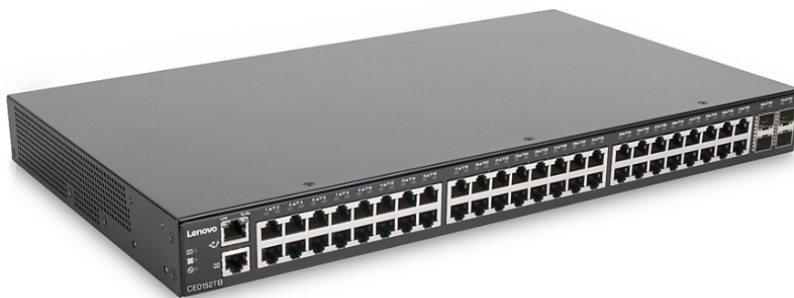
Figure 1. Lenovo CE0152TB Switch

The Lenovo CE0152TB Switch is shown in the following figure.