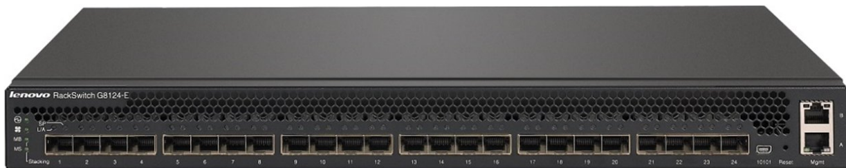
Figure 1. Lenovo RackSwitch G8124E

With support for 1 Gb Ethernet or 10 Gb Ethernet, the G8124E switch is designed for those clients that use 10 GbE today or plan to in the future. This switch is the first top of rack (TOR) 10 GbE switch that supports Lenovo Virtual Fabric, which helps clients significantly reduce cost and complexity when it comes to the I/O requirements of most virtualization deployments. Virtual Fabric can help clients reduce the number of multiple I/O adapters down to a single dual-port 10 GbE adapter and reduce the required number of cables and upstream switch ports.