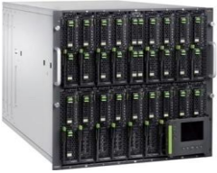
PRIMERGY BX900 S2

Le BX900 ou "Dynamic Cube" offre la performance, l'évolutivité, la disponibilité et la flexibilité que vous recherchez pour vos besoins dans le cadre de projet de consolidation et virtualisation dans votre Data Center. Le châssis BX900 S2 peut recevoir jusqu'à 18 serveurs lames biprocesseur dans un format rack de 10U. Sa densité et sa possibilité de cascading jusqu'à 4 châssis offre une évolutivité inégalée pour une protection totale de votre investissement.