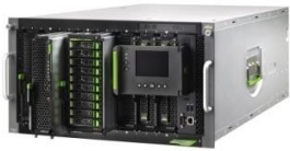
PRIMERGY BX400 S1

Le BX900 ou "Dynamic Cube" offre la performance, l'évolutivité, la disponibilité et la flexibilité que vous recherchez pour vos besoins dans le cadre de projet de consolidation et virtualisation dans votre Data Center. Le châssis BX900 S2 peut recevoir jusqu'à 18 serveurs lames biprocesseur dans un format rack de 10U. Sa densité et sa possibilité de cascading jusqu'à 4 châssis offre une évolutivité inégalée pour une protection totale de votre investissement.