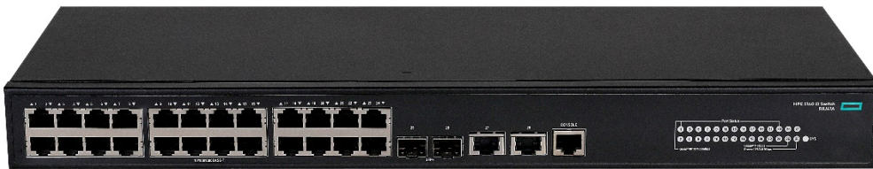
HPE FlexNetwork 5140 24G 2SFP+ 2XGT EI Switch (R8J41A)