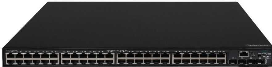
HPE FlexNetwork 5140 48G PoE+ 4SFP+ EI Switch (JL824A)

High availability, simplified management, and comprehensive security control policies are among the key features that distinguish this series.