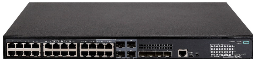
HPE FlexNetwork 5140 24G PoE+ 4SFP+ EI Switch (JL827A)