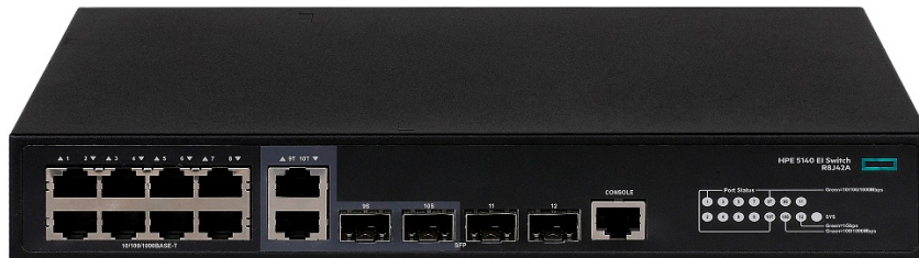
HPE FlexNetwork 5140 8G 2SFP 2GT Combo EI Switch (R8J42A)