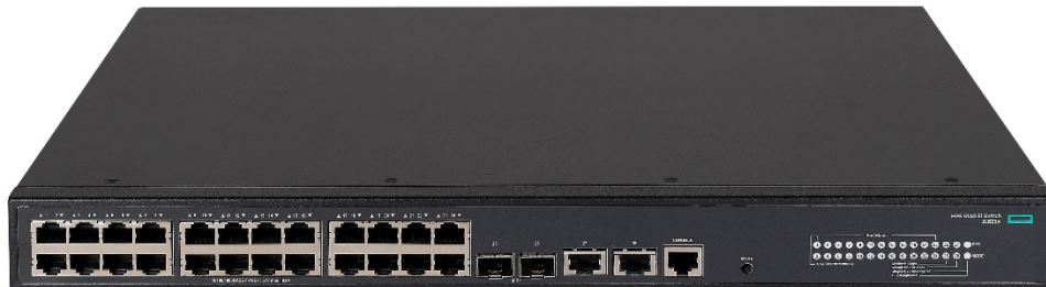
HPE FlexNetwork 5140 24G POE+2SFP+2XGT EI Switch (JL823A)