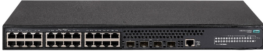
HPE FlexNetwork 5140 24G 4SFP+ EI Switch (JL828A)