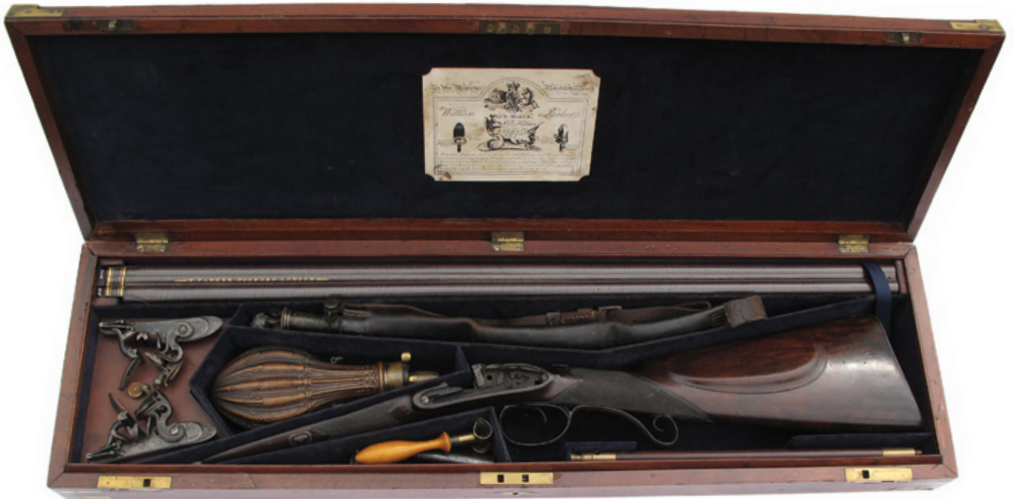
Lot 132 - Calisher & Terry .40 bore double rifle

Front Cover and below, lot 133 - 16 bore flintlock fowler by William Parker