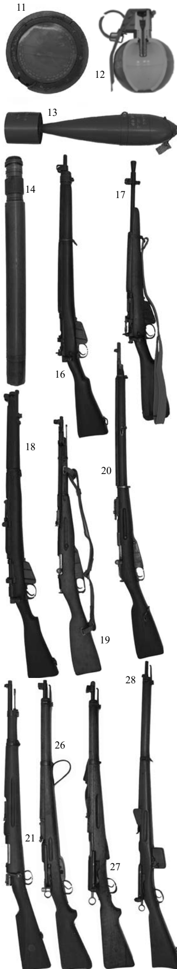
Photographs not necessarily to scale