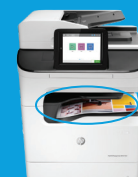
350-sheet inner finisher with stapler 23