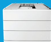
3x550-sheet tray and stand