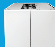
4,000-sheet HCl paper tray and stand