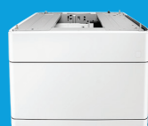
550-sheet tray and stand