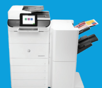
3,250-sheet external finisher with stapler 23