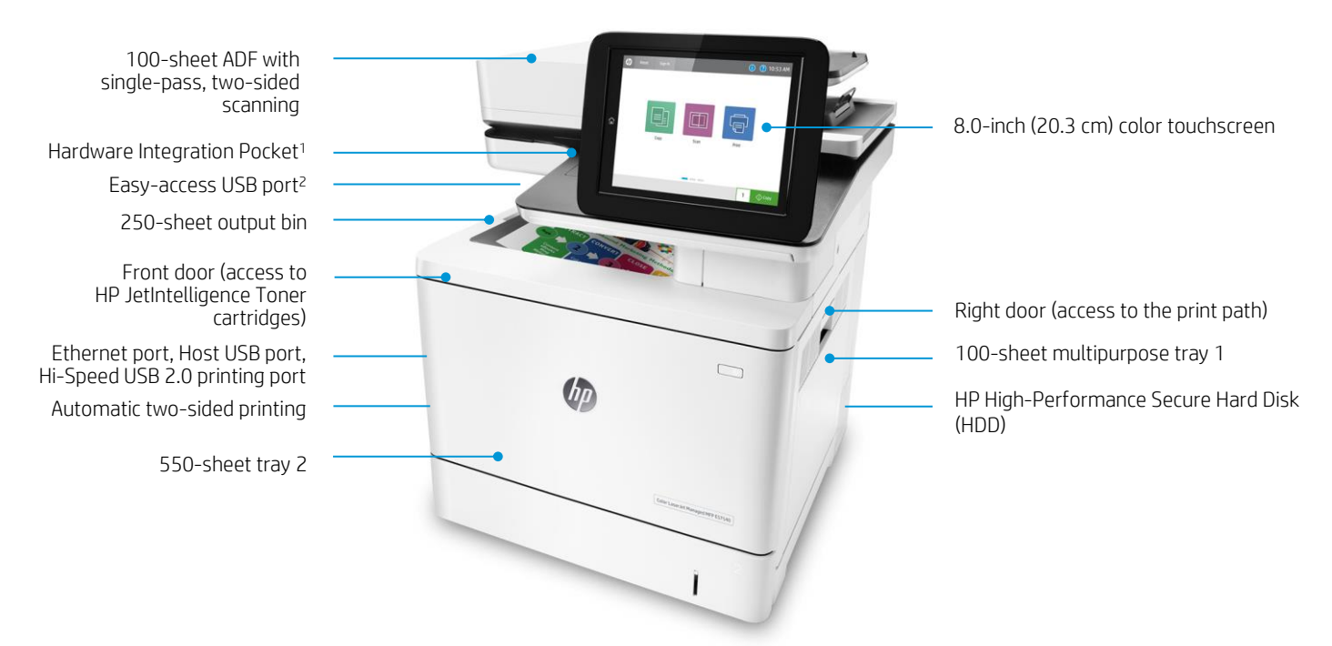
HP Color LaserJet Managed Flow MFP E57540dn