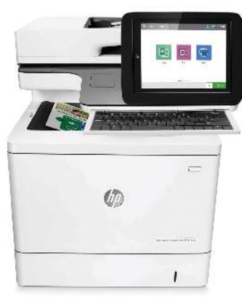
HP Color LaserJet Managed Flow MFP E57540c