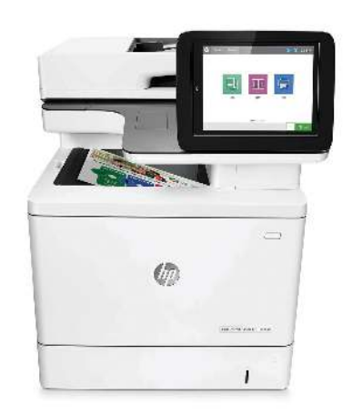
HP Color LaserJet Managed MFP E57540dn

Ideal for enterprises and medium businesses that need a secure, highly productive, energy-efficient color MFP.