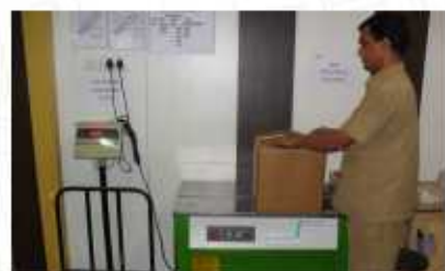
Final Packaging for Safe & Secure Transportation