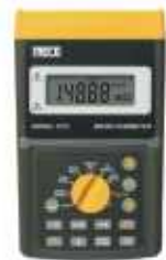
Micro / Mili Ohm Meters