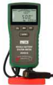
Vehicle Battery System Meter