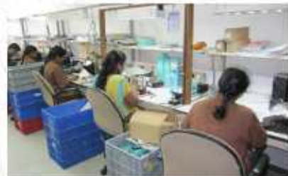
Meter Assembly Line