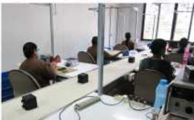
Conveyor-Belt Production Line