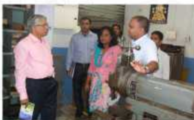
In-House Tool Room Facility