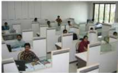
Sales & Marketing Department