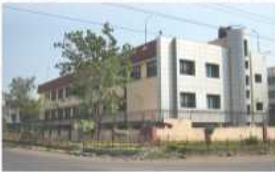
Welcome to MECO - Mahape