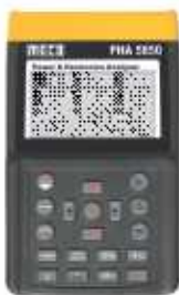
Power & Harmonics Analyzers