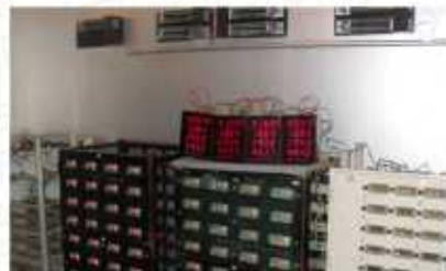
Burn-In at 55°C to Ensure Stability