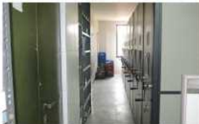
Stores & Material Handling