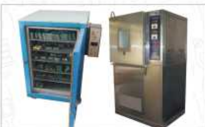
Environmental Chamber To Simulate -20°C to 100°C (Rh upto 100%)