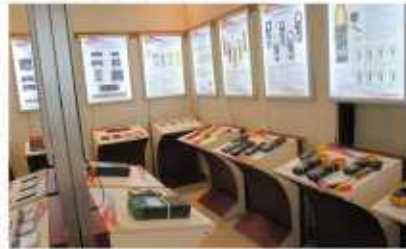
Product Display Gallery