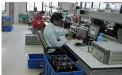
World Class Calibrating Equipment