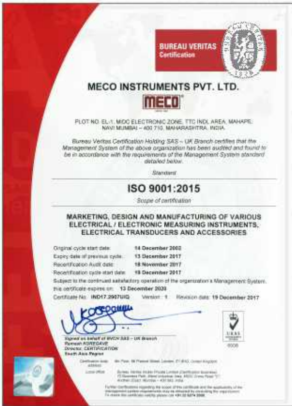
ISO 9001:2015 CERTIFICATE