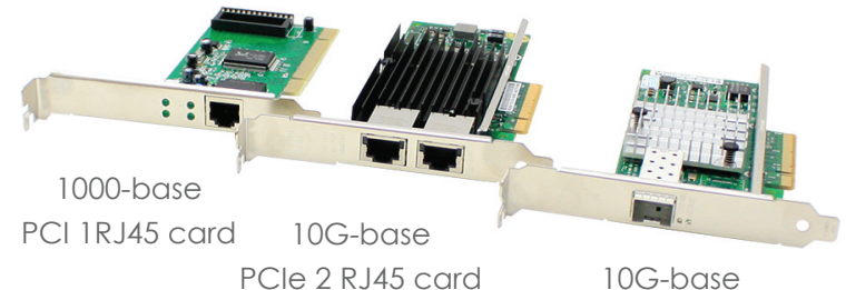
2 RJ45 card 10G-base PCle 1 open SFP+ card

Featured parts GDT-PCIE-1SFP-FX1 GDT-PCIE-4RJ45 GDT-PCIE-2RJ45-10G GDT-PCI-ST-FX