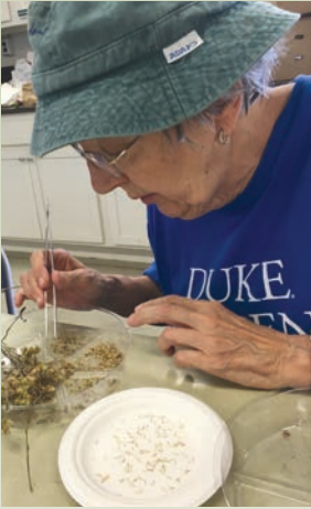
Clockwise from top left: Schweinitz's sunflower ( Helianthus schweinitzii ) in the Piedmont Prairie; a volunteer cleans seeds for the Blomquist Garden; 'Benary's Giant Salmon Rose' ( Zinnia elegans ) in the Charlotte Brody Discovery Garden; chickens enjoy a meal in the Discovery Garden.