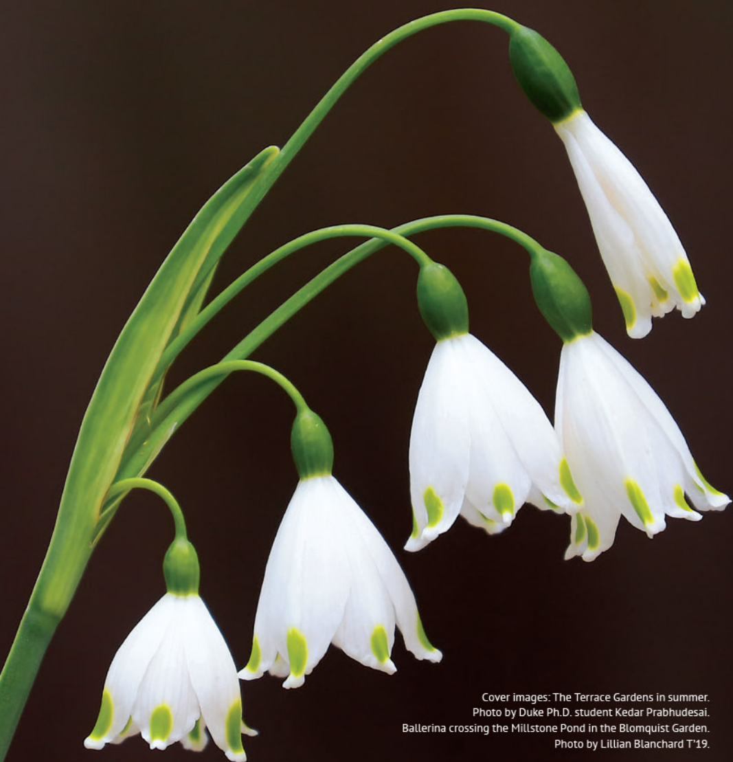
Cover images: The Terrace Gardens in summer. Ballerina crossing the Millstone Pond in the Blomquist Garden.

This page: Giant snowflake ( Leucojum aestivum ). Photo by Brian Wells.