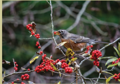
Above: Above: A robin redbreast enjoys berries from a winterberry holly ( Ilex verticillata ).