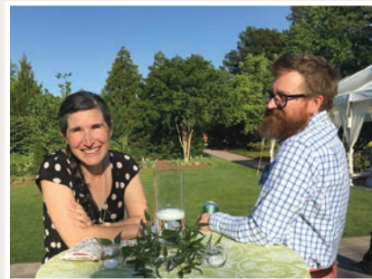
This page and p.50: Receptions in the Doris Duke Center and the Piva Terrace.