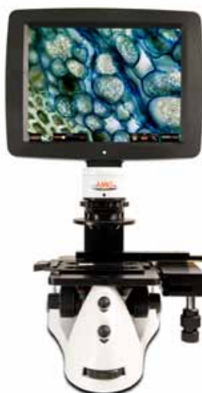
EVOS xl core