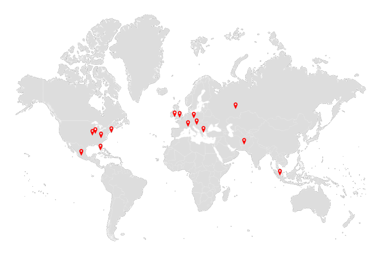
Fig. 4. Geolocation of Discovered IP Addresses

accessing the Internet through a router employing Network Address Translation (NAT).