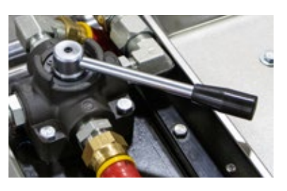
Manual Reverser Kit #40100055 (TTCF-MR) Don't struggle with uncoupling, switching and recoupling hot lines. Change the