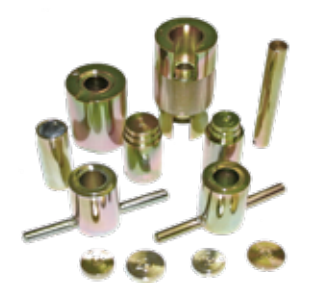
AW Toyota/Lexus Sm/Lg Canister SL Solenoid Kit #40200621 (TTCF-945)

Aisin Solenoid Connector Saver Ring #40200619 (TTCF-960)