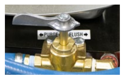
Fluid Purge Valve #40300279 (TTCF-PV) Purge contaminated fluid into a disposal container, prolonging the life of cleaning fluid and filters.