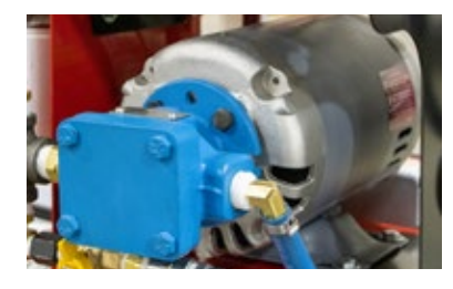
Pump & Motor #40300277 (TTCF-VPBM) TTCF-MO 40200460 Motor Only TTCF-PO 40200459 Pump Only