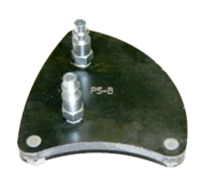
P5-B Adapter #40200613 (TTCF-P5B) Toyota/Lexus A90E transmission puck-style cooler adapter