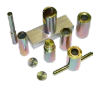
AW Late-Model Small Canister Solenoid Kit #40200622 (TTCF-944)