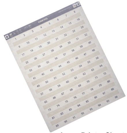
Laser Printer Sheets