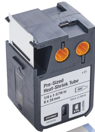
Heat-shrink Tube Pre-sized Labels