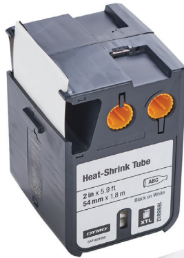
Heat-shrink Tube Continuous Label Tape

DYMO heat-shrink tube labels provide insulation when shrunk down and ensure a secure fit on wires and cables with a 3:1 shrink ratio. Constructed of flame-retardant polyolefin. Available in sizes from 1/4 in to 2-1/8 in wide, with black text on a white background.