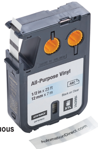
All-Purpose Continuous Label Tape

DYMO all-purpose vinyl labels are ideal for almost any labeling application. Vinyl provides moisture, chemical, and UV resistance for both indoor and outdoor applications. Available in sizes from 1/2 in to 2in wide and a variety of text and background colors.