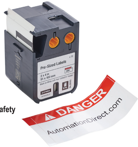
Pre-sized Safety Labels

DYMO pre-sized safety labels provide highly visible labels with pre-printed NOTICE headers. Also available with a blank colored header. Constructed of vinyl. Available in 2x4 inch size only, with black text on a white background and an orange, yellow, blue, or red header.