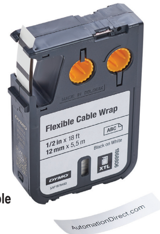
Flexible Cable Wrap

DYMO flexible cable wrap is ideal for labeling cables, wires, and other rounded surfaces. Constructed of flexible, tear-proof nylon. Available in sizes from 1/2 inch to 1 inch wide, with black text on a white background.