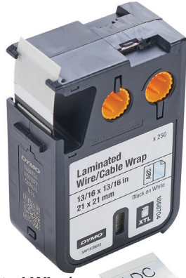
Laminated Wire/ Cable Wrap

DYMO pre-sized wire/cable wraps have a laminated overwrap that protects against oil, chemicals, moisture, abrasion, and fading. In addition to the XTL-compatible label cartridges, laminated wire/cable wrap labels are available in sheets compatible with standard laser printers. Constructed of vinyl (XTL cartridges) or polyester (printer label sheets). Available in sizes from 13/16 in to 2in wide, with black text on a white background.