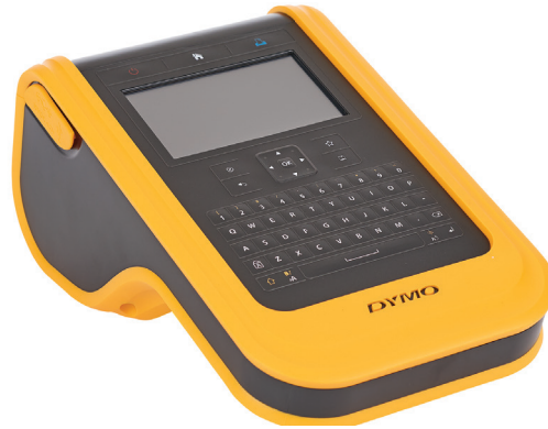
XTL 500 (1868815)

The XTL 500 label maker provides an enhanced, robust label making solution for labels up to 54mm (2-1/8") wide. The XTL 500 is ideal for general identification, barcodes (1D and 2D), asset tracking, data communications identification, and MRO/facilities identification and communication.