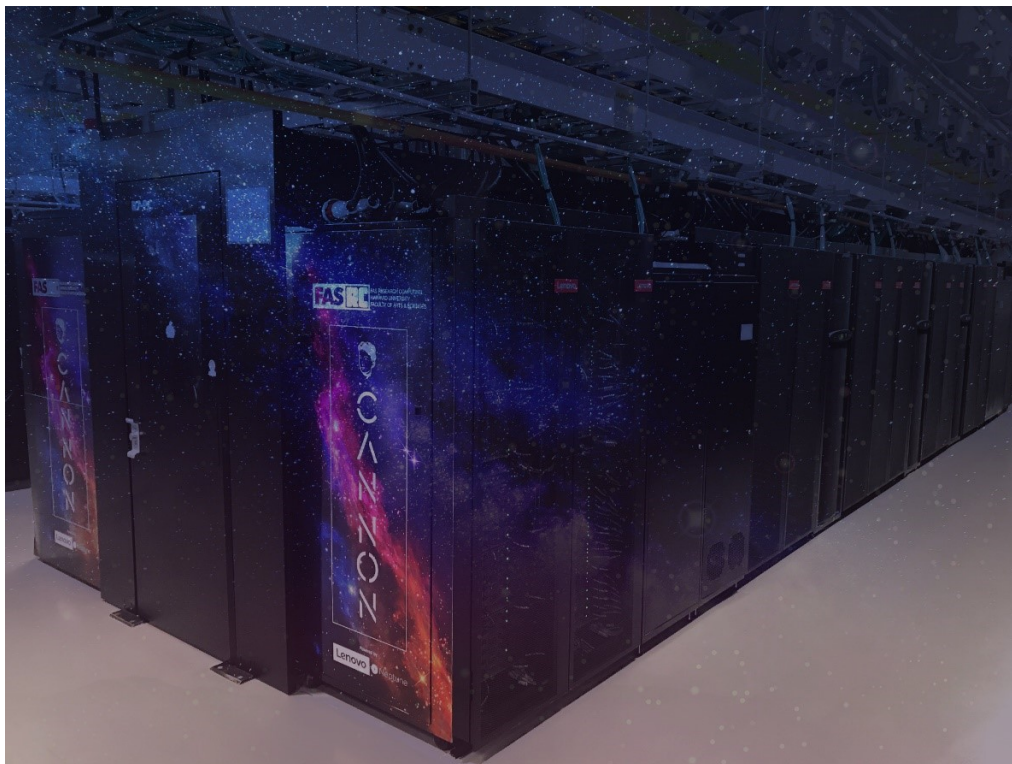
Harvard University Faculty of Arts & Sciences (FAS) Research Computing

These customers have already implemented LeSI solutions. Click the links to review the customer case studies.