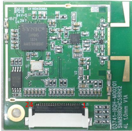
Fig 8.1 Pin sequence of SY5-A24 Module