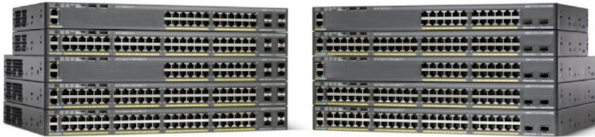
Figure 1. Cisco Catalyst 2960-X Series Switches

Cisco® Catalyst® 2960-X and 2960-XR Series Switches are fixed-configuration, stackable Gigabit Ethernet switches that provide enterprise-class access for campus and branch applications (Figure 1). They operate on Cisco IOS® Software and support simple device management as well as network management. The Cisco Catalyst 2960-X and 2960-XR Series provide easy device onboarding, configuration, monitoring, and troubleshooting. These fully managed switches can provide advanced Layer 2 and Layer 3 features as well as optional Power over Ethernet Plus (PoE+) power. Designed for operational simplicity to lower total cost of ownership, they enable scalable, secure, and energy-efficient business operations with intelligent services. The switches deliver enhanced application visibility, network reliability, and network resiliency.