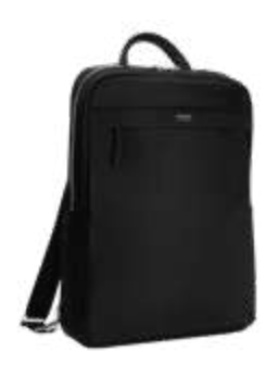
15" Newport Ultra Slim Backpack TBB598GL | MSRP: $89.99