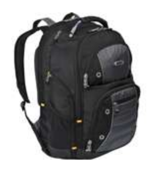
Drifter II Backpack TSB238US | 16" | MSRP: $84.99 TSB239US | 17" | MSRP: $99.99