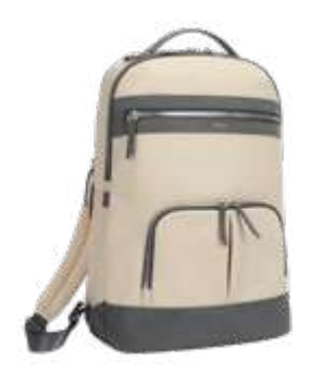
15" Newport Backpack TBB59906GL | MSRP: $99.99