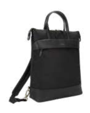
15" Newport Convertible 2-in-1 Tote/Backpack