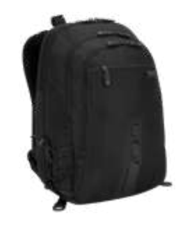
Spruce<sup>™</sup> EcoSmart<sup>®</sup> Backpack TBB013US | 15.6" | MSRP: $72.99 TBB019US | 17" | MSRP: $89.99