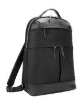
15" Newport Backpack TSB945BT | MSRP: $99.99