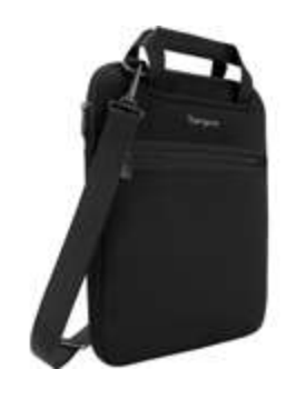
12" Vertical Slipcase with Hideaway Handles TSS912 | MSRP: $16.99

14" Vertical Slipcase with Hideaway Handles