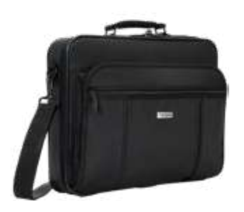
15.4" Premiere Clamshell Case