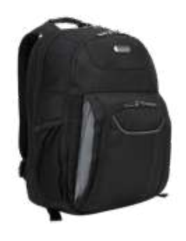
16" Air Traveler Checkpoint-Friendly Backpack