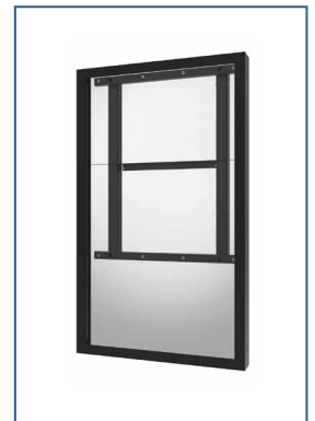
Portrait Orientation Available (EWP-OH85F)