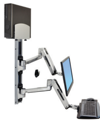
LX Sit-Stand Wall Mount System

* Weight Capacity: display 5-25 lbs (2,3-11,3 kg); keyboard 5 lbs (2,2 kg); CPU 40 lbs (18 kg). Monitor depth may affect weight capacity