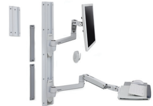
LX Wall Mount System, White