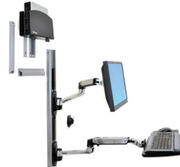
LX Wall Mount System