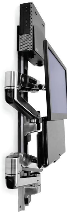
LX Sit-Stand Wall Mount System shown with Medium CPU Holder

LX Sit-Stand Wall Mount System: Keyboard folds to within 6.8" (17,3 cm) of wall in storage position; LCD arm folds back to a depth of 5.5" (14 cm)