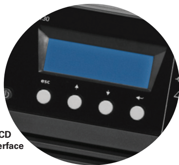
Bright LCD user interface