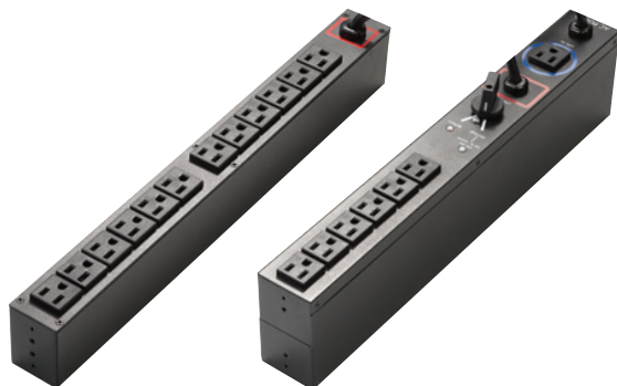
Optional FlexPDU and HotSwap MBP for greater flexibility and uptime