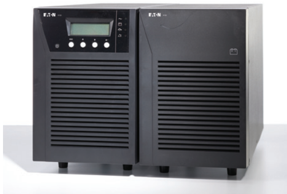
Add up to four EBM's for hours of runtime