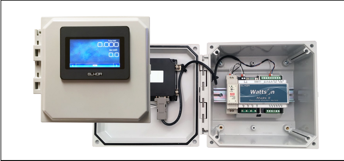
W2KIT-S (with external display)