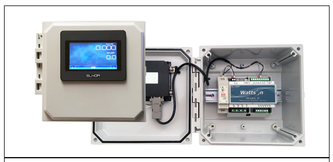
W2KIT-S (with external display)