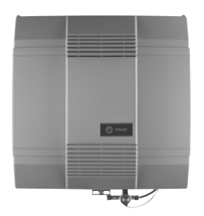
Fan Powered Humidifier