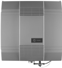
Fan Powered Humidifier