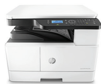
HP LaserJet MFP M42625dn