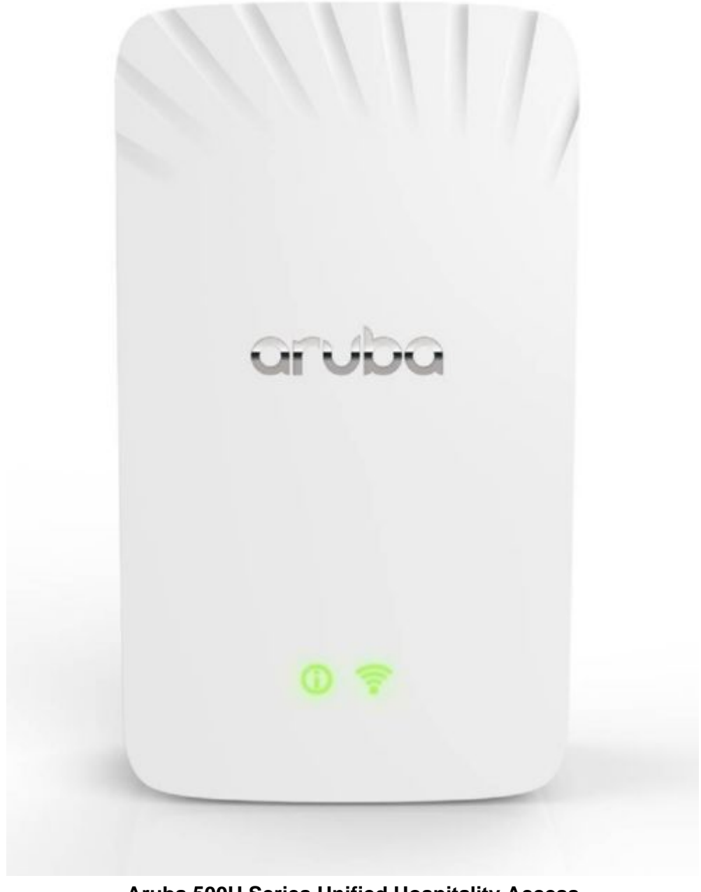
Aruba 500H Series Unified Hospitality Access

These economical Wi-Fi 6 access points provide high-performance connectivity for any organization experiencing growing mobile, cloud and IoT requirements. With a wireless aggregate data rate of up 1.5 Gbps and gigabit local wired ports, they deliver the range of connectivity options needed for venues such as hotels, residence halls, and remote offices alike.